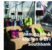
benugo bar & kitchen @ BFI Southbank

A winsome kids' menu of parent-reassuring quality. Festival Riverside, Southbank Centre, SE1 (020 7928 2004)