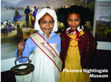
Florence Nightingale Museum