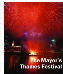
The Mayor's Thames Festival

Working round here is just fantastic. There is so much on offer, and so much to see walking along the river. I love mornings here – you see people rowing down the Thames. There are plenty of green spaces; Bernie Spain Gardens is a lovely place for lunch.