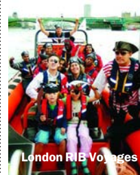
London RIB Voyages

This all-weather cruise takes in the Houses of Parliament, St Paul's Cathedral and the Tower of London. It departs from the beautiful pier at the foot of the London Eye. London Eye Millennium Pier, SE1 (0870 5000 600). Nov-March first cruise leaves at 11.45am, then every hour thereafter until 4.45pm. April-Oct first cruise 10.45am, last cruise 6.45pm