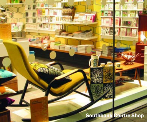
Southbank Centre Shop