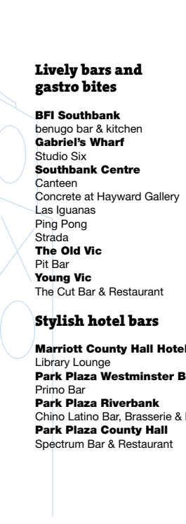
Le Pain Quotidien, The Oxo Wharf, and The Old Vic