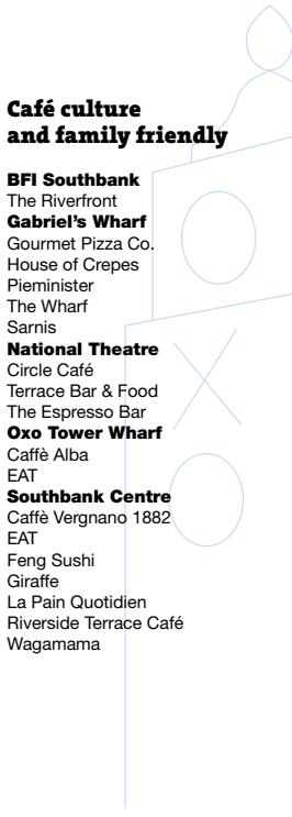
Le Pain Quotidien, The Oxo Wharf, and The Old Vic