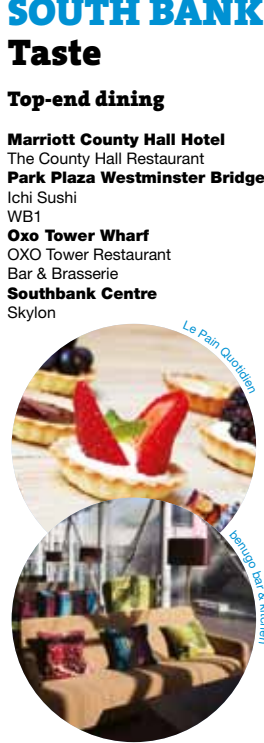
Le Pain Quotidien, The Oxo Wharf, and The Old Vic

discoverlondonbridge.com visitbankside.com southbanklondon.com