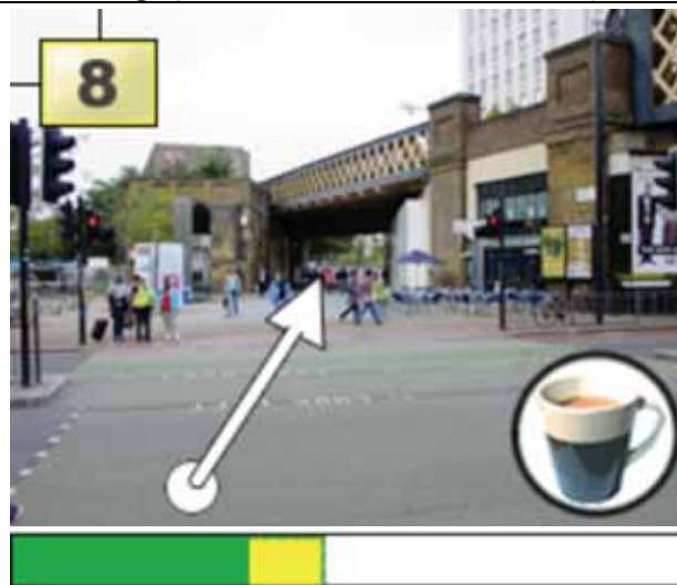
Cross at the pelican crossing . Straight ahead is a bridge. Go under the bridge (Sutton Walk).