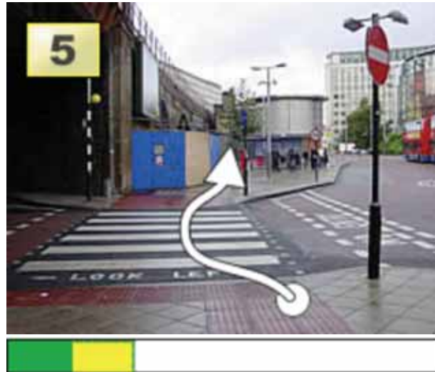
Cross at the zebra crossing . Go past the bus stops and round building (this can be crowded ).