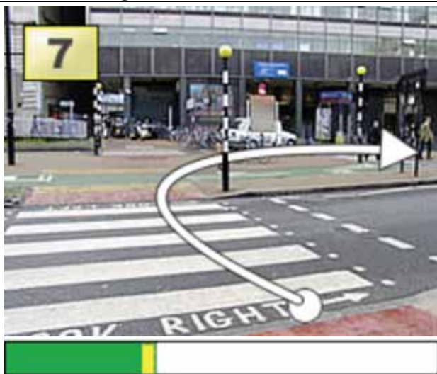
Cross at the zebra crossing straight ahead. Then turn right and use the next zebra crossing .