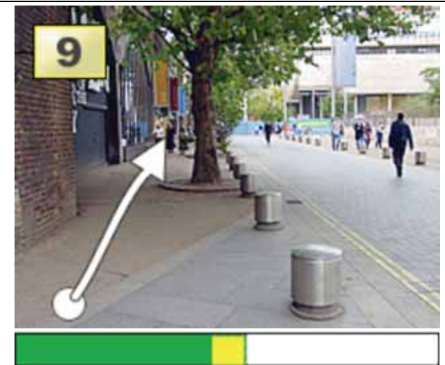
From the bridge go straight down the road (Concert Hall Approach). Cross at the level crossing area.