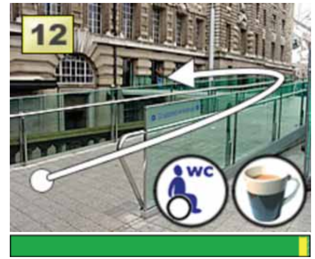
On the left is the step-free entrance to the Ticket Office. You can buy your ticket here.