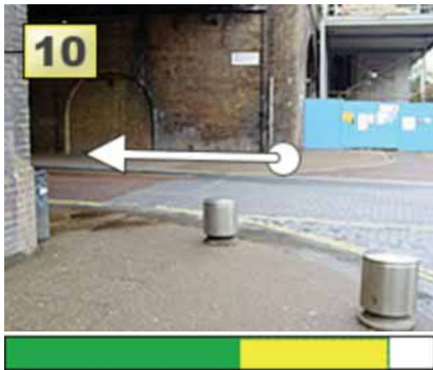
Turn left and go along Belvedere Road. Go under the bridges .