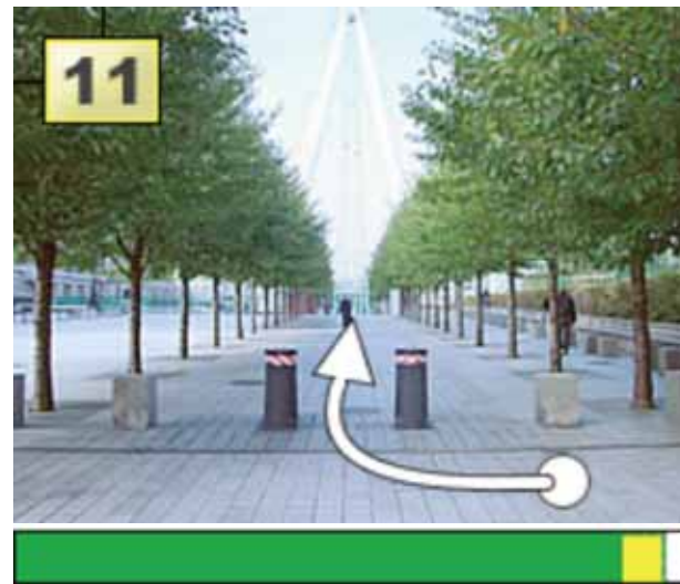
Near the end of the road is a flat paved area in front of the Eye. Go towards the Eye.