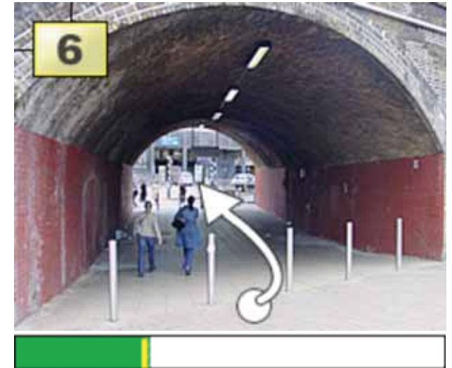
Next to Java Stop café is a railway arch (Boyce Street). Go through here.